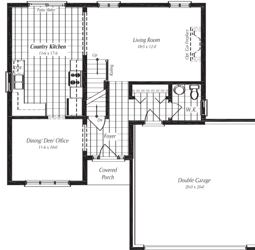
MAIN FLOOR PLAN - Elevation 'A'